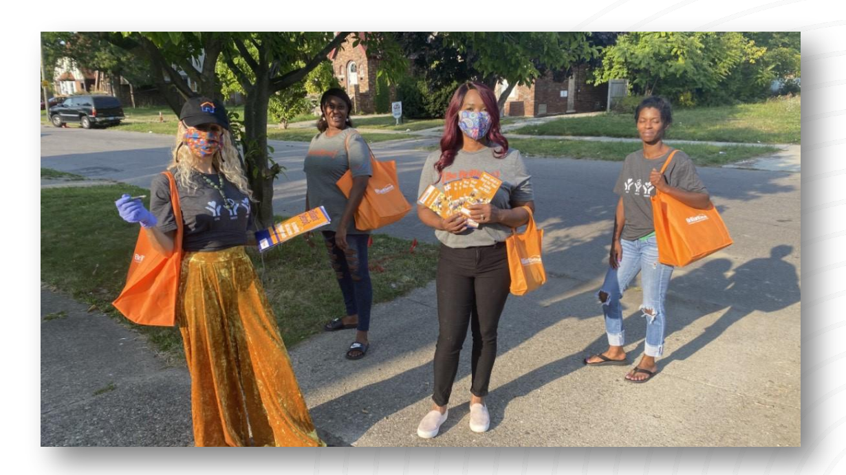
2022 KIP:D+ Implementation grantee Brilliant Detroit poses as a team.

Building on their asset-based approach to community development, Brilliant Detroit is using their Implementation grant to create a Talent Bank and Kid Success Park in the Morningside neighborhood.