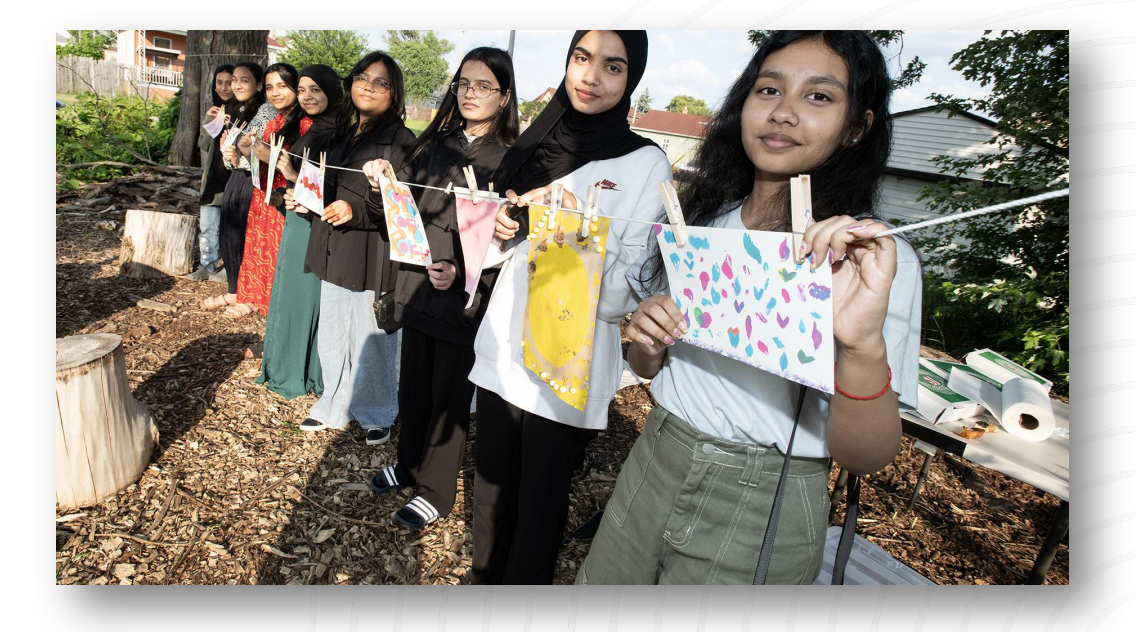
2023 Planning + Implementation grantee, Women of Banglatown youth advisory council members pose with the art work they made on their "Art Night" in the park on the corner of Lawley and Mitchell Streets in Detroit

Women of Banglatown is using their Planning + Implementation grant to design and build a space by and for first generation and immigrant girls and young women to explore themselves through nature, art, entrepreneurship, and community.