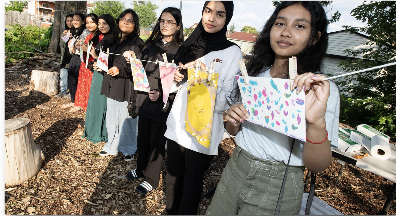
2023 Planning + Implementation grantee Women of Banglatown youth advisory council members pose with the art work they made on their "Art Night" in the park on the corner of Lawley and Mitchell Streets in Detroit