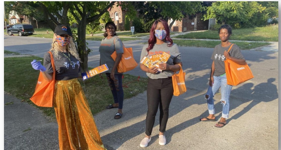
2022 KIP:D+ Implementation grantee Brilliant Detroit poses as a team.

Building on their asset-based approach to community development, Brilliant Detroit is using their Implementation grant to create a Talent Bank and Kid Success Park in the Morningside neighborhood.